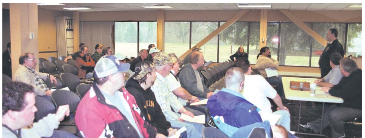
At the Contract Ratification Vote Meeting for XPEDX members of both Locals 174 and 117. They voted to accept their proposed new Contract.