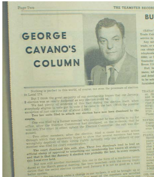
This logo appeared regularly in the Teamster Record between 1958 and 1975.