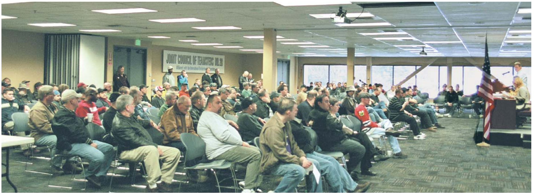
Some of the Local 174 members in attendance at the February 10th General Membership Meeting.