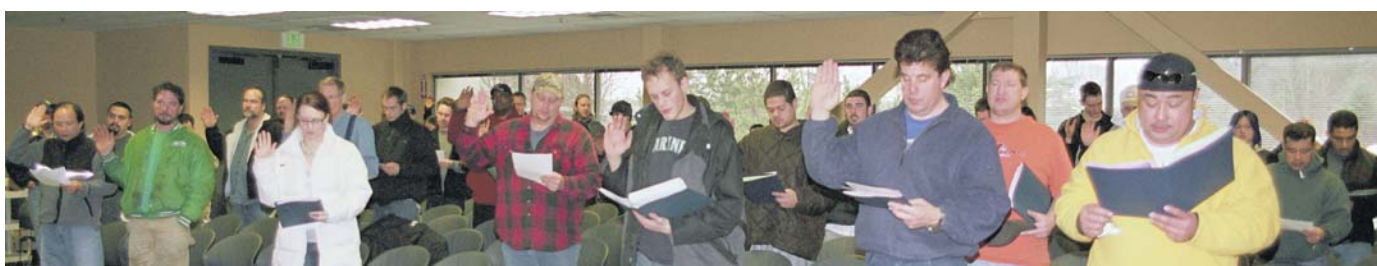
On February 10th following their Initiates Meeting the “new members” take their official oath of membership.

Members can also purchase Local 174 merchandise at our General Membership Meetings.