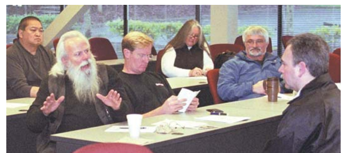
At the Active USA Demands Meeting in the JC-28 Headquarters Building in Tukwila on January 6.