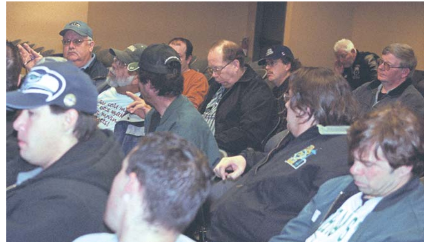
In the pictures above are some of the members at the Peninsula Truck Lines Demands Meeting on January 19th.

STAY INFORMED! --- READ THE LOCAL 174 WEBSITE! --- WWW.TEAMSTERS174.ORG